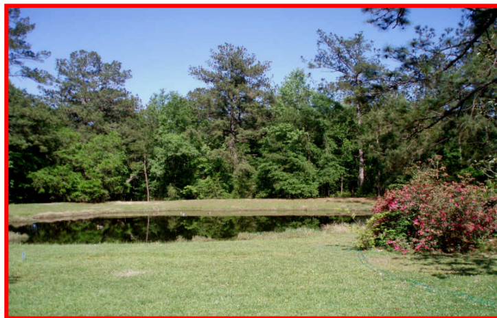
New Casting Pond – Folsom, LA

Developed fly casting programs for the disabled and handicapped, and for cancer rehabilitation